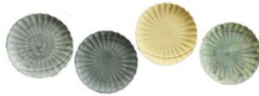
CAST FROM A DIFFERENT CLOTH Little Owl Design apply textiles to plates, the texture transferring and revealed in surprising detail in the porcelain. The collection, created in Amsterdam, is dishwasher safe. Moon plates, €120 each, littleowl.eu