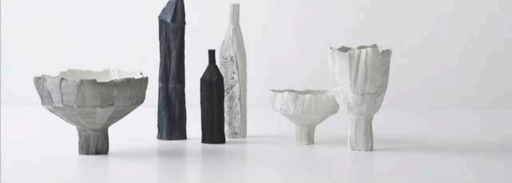
↑ Paola Peronetto, Cartocci Print, vases, bowls and lamps

Inspired by the natural world and, in particular, by flowers, Paola Peronetto's new creations, like all the previous versions, have a distinct artisan connotation that makes them unique and one-off. An autonomous personality emerges from each object, giving it a different form, tactile sensation and compositional details and from all the others. This is even more true in the Cartocci Print collection, which can be applied both to smooth paper and to bark, with a textured surface that alternates smooth and rough segments to give a new and striking material quality to each piece.