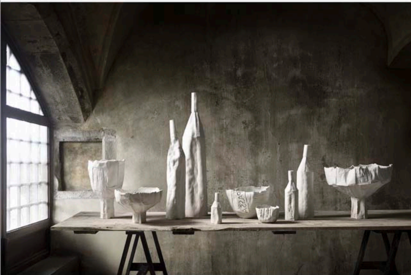
↑ Paola Peronetto, Cartocci Print, vases and bowls

Inspired by the natural world and, in particular, by flowers, Paola Peronetto's new creations, like all the previous versions, have a distinct artisan connotation that makes them unique and one-off. An autonomous personality emerges from each object, giving it a different form, tactile sensation and compositional details and from all the others. This is even more true in the Cartocci Print collection, which can be applied both to smooth paper and to bark, with a textured surface that alternates smooth and rough segments to give a new and striking material quality to each piece.